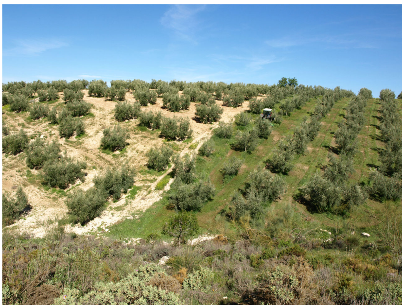
Fig. 1 Conventional ( left ) and organic ( right ) olive orchards in South Spain